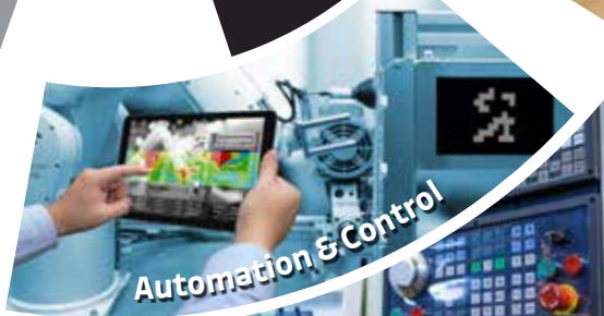
Automation & Control