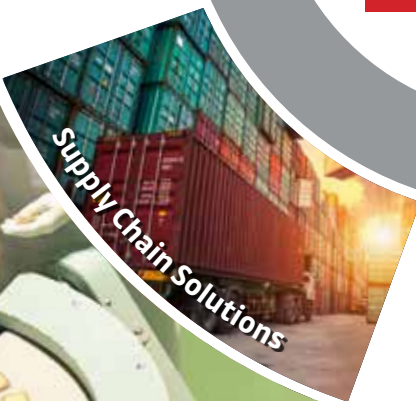
Supply Chain Solutions